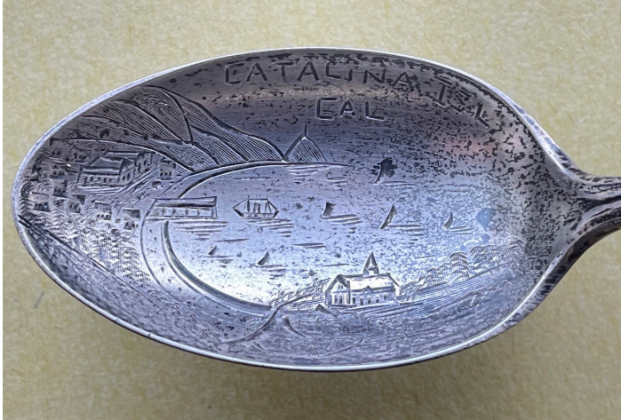
on Watson #311 - figural fish